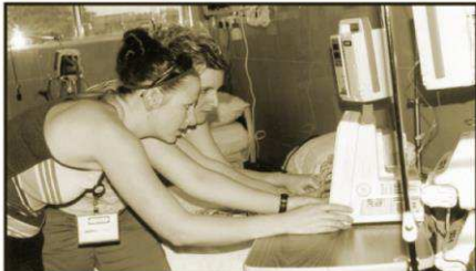
*Medical Personnel from USA monitoring an Open Heart Surgery Machine at UNTH, Ituku/Ozalla, Enugu